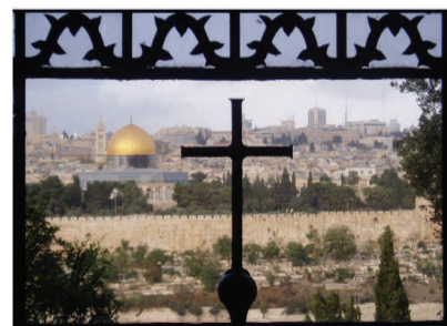
Jerusalem from the Mount of Olives